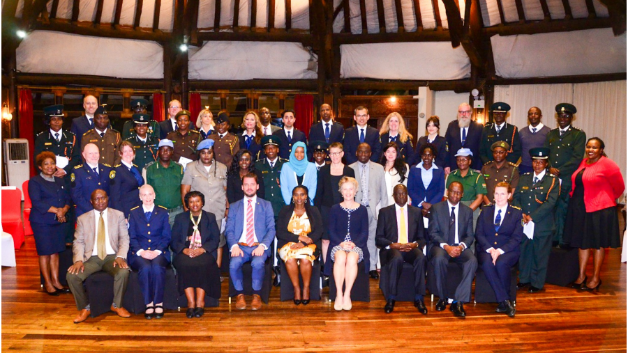
Principal Secretary, Correctional Services, Secretary PACS , guests and graduates