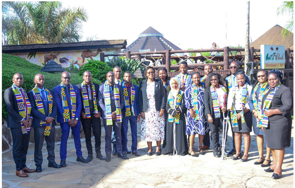
Director, PACS with Probation Officers graduating for the PSELF programme