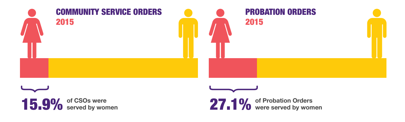
Table 3: Number of offenders serving Community Service Orders (CSOs)36